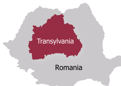
Figure 1. Geolocation of Transylvania on the Romanian map

One of the oldest and most picturesque historical and folkloristic areas of Romania is Transylvania. It consists of ten counties and is the largest region on the Romanian territory, as it is located in the center of the country (Csoka, 2020), as can be seen in Figure 1.